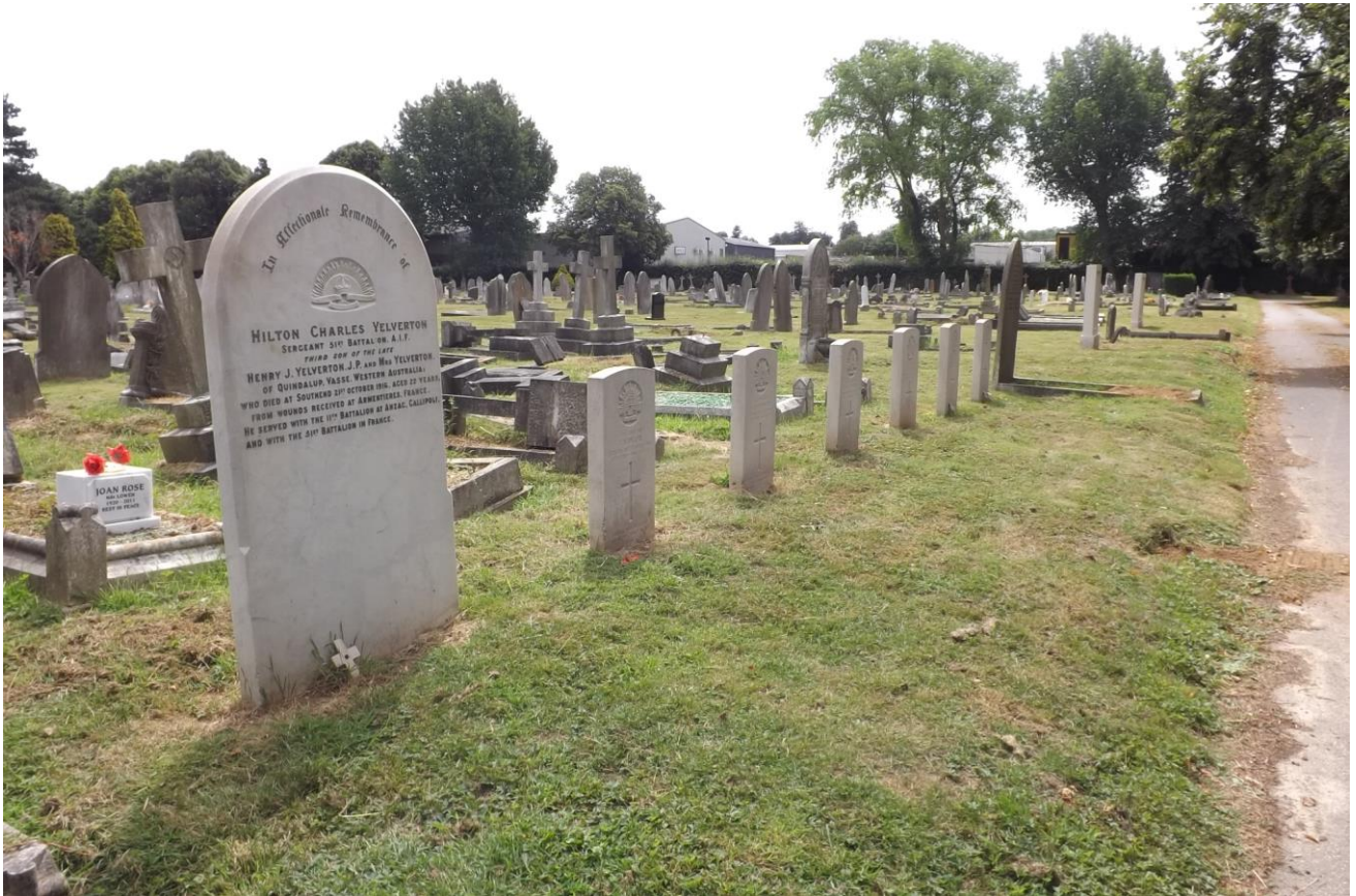
Row of 7 Australian WW1 Headstones